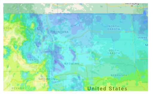
Winter hardiness zones projected for end of century under the lower emission scenario