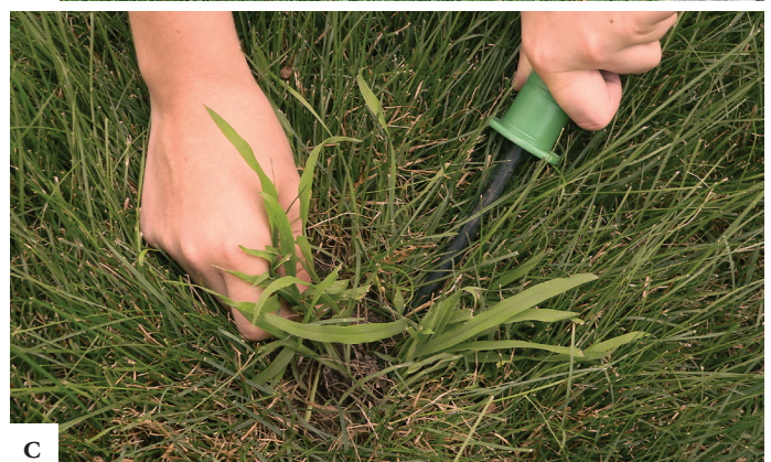
FIGURES A & B. CRABGRASS TENDS TO GROW ALONG SIDEWALKS AND DRIVEWAYS WHERE TURF IS WEAKER AND THINNER FIGURE C. EASY TO SPOT IN A LAWN, CRABGRASS IS LIGHTER GREEN WITH THICKER BLADES

The scientists at The Davey Institute laboratory and research facility support our arborists and technicians in diagnosing and prescribing based on the latest arboricultural science. For specific treatment and application details, your arborist may consult The Davey Institute's Plant Health Care Book .